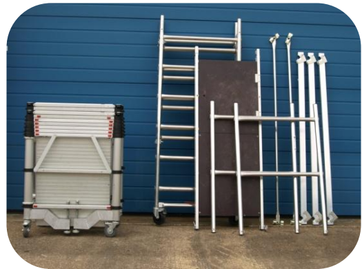
Teletower shown against a standard 2 metre tower