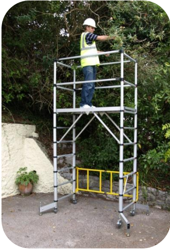
Can be used on uneven ground utilising stabiliser legs