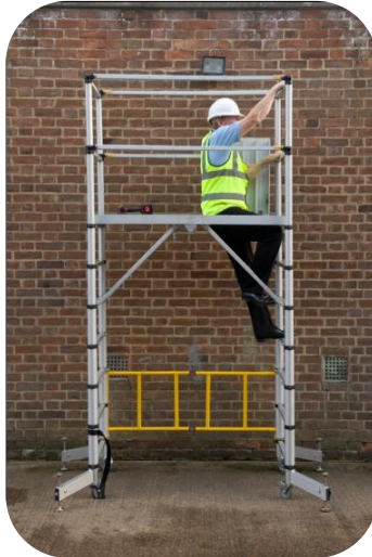
Large climb-through platform hatch