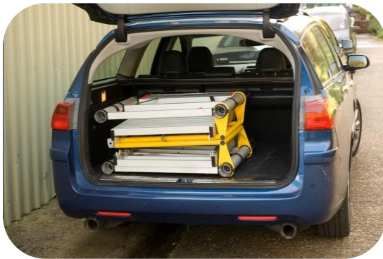
Can be transported in an estate car or small van